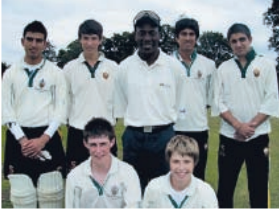
To the great delight of the staff and pupils, cricket legend Henry Olonga's visit to the School included coaching the 1st XI.