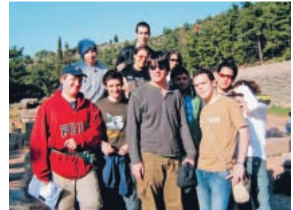
Left – Sixth Form pupils, including A Level Classics, students in the Stadium in Delphi. Right – In the Olympic Stadium in Olympia.