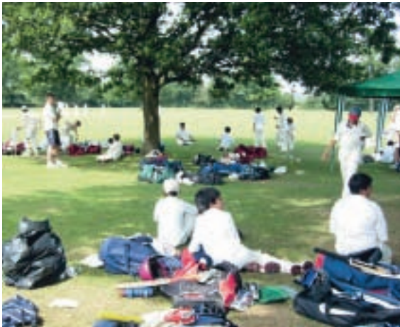
Boys relax between games.