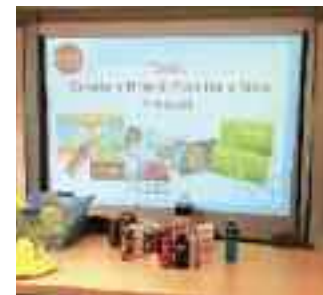
The students enjoyed the task of creating and marketing a new line of drinks for the company, to fit alongside their other well known brands.