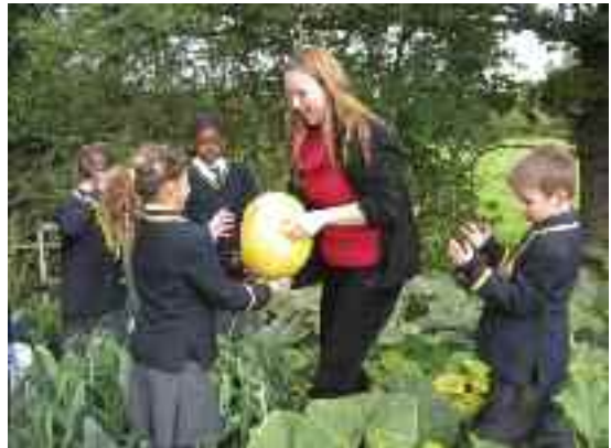
The Gardening Club harvested a bumper crop of pumpkins.