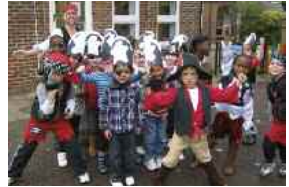
Have you seen Blackbeard the Pirate anywhere?

On our annual Shakespeare's Day the pupils had a great time and learned a great deal as they were taken through Shakespeare's Julius Caesar .