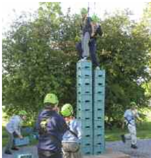
Cadets on the CCF Activity weekend in the Brecon Beacons.

Year 13 Business Studies students visited Coca Cola's North London Edmonton factory on a regular trip which offers an insightful and informative tour of the production facilities at the plant. Each production line makes 20,000 bottles of Coke an hour. That's 2 million bottles a day - enough to supply North London!