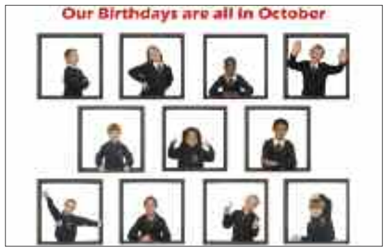
The ASPA Prep Christmas fundraiser is a calendar and each month includes a picture of every child from Nursery to Year 6 whose birthday occurs in that month.