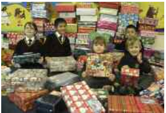
The Prep children help with Operation Christmas Child, which involved filling and wrapping shoeboxes to be sent to less fortunate children.