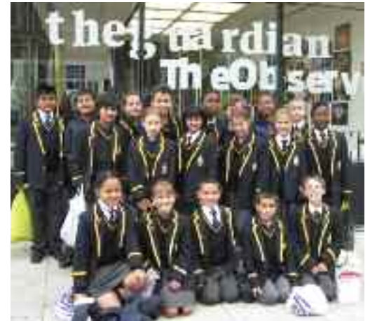
Year 5 on their trip to the Guardian newspaper

On our annual Shakespeare's Day the pupils had a great time and learned a great deal as they were taken through Shakespeare's Julius Caesar .