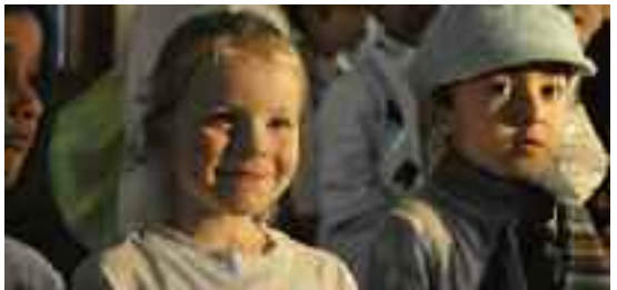
The Pre-Prep Christmas production was the Little Fir Tree . The quality was excellent throughout and the children enjoyed their chance to perform to parents and grandparents. The collection at all the Prep Christmas performances was for Great Ormond Street Hospital and SOS Children's Villages.