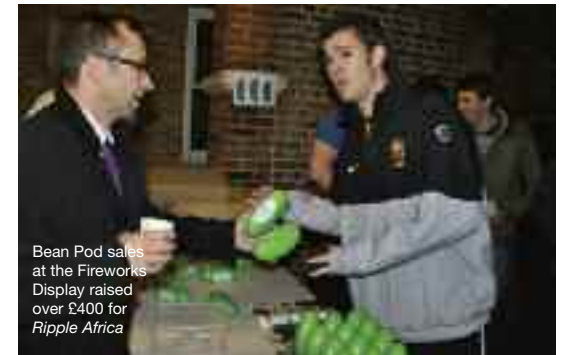
Bean Pod sales at the Fireworks Display raised over £400 for Ripple Africa

Check our website for more details of the Hell's Kitchen event on 12th March and a Staff 'X Factor' evening (limited tickets), planned for the summer term. To find out more about the work of Ripple Africa, please log on to their website for recent news and updates: www.rippleafrica.org .