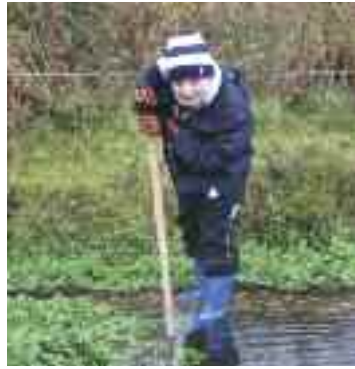
It was an action packed time for Year 6 when they visited Hudnall Park.