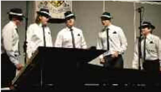
Leeman's, winners of the Part Song.