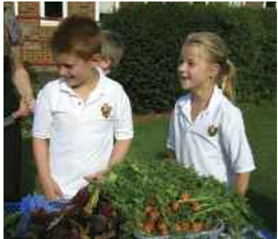
The Gardening Club produce was sold at the Prep School Fair's first plant stall.